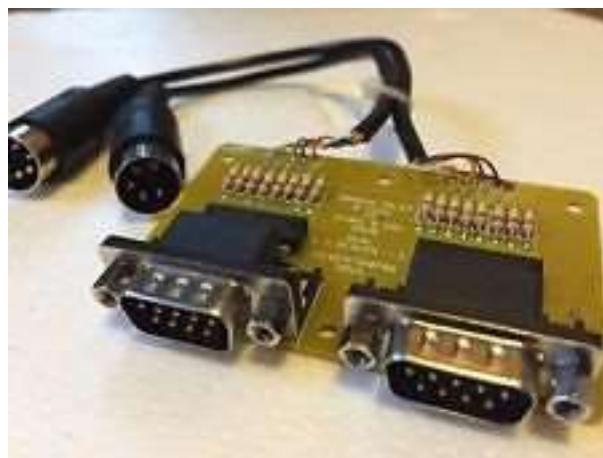
Atari to CoCo Joystick Adapter

Here's a fun and easy project I've loved using with my CoCo. This adapter was designed to interface an Atari(or C64) style joystick to you CoCo. This is great for games like Zaxxon or Ghana Bwana, where analog controllers are sometimes too sensitive. I left the Atari connector out of the schematic so you can also easily convert a dusty PC gamepad or nearly any "digital" (meaning on/off switches as opposed to analog 0-5v) joystick. I attached an Atari joystick cable to an old Nintendo gamepad, plugged into this circuit to plug into my CoCo. Talk about a Frankenstein setup!